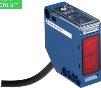
photo-electric sensor - XUK - receiver - Sn 30m - 12..24VDC - cable 2m