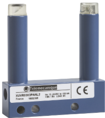
photo-electric sensor - XUV - fork - 30X30mm - 12..24VDC - cable 2m